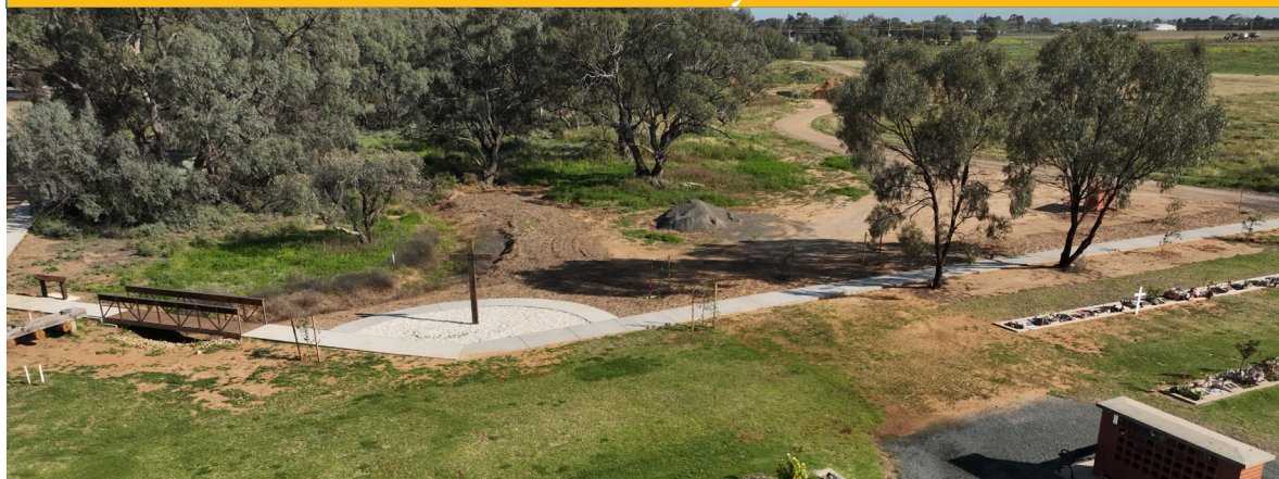
Upgrade works to Hay Cemetery